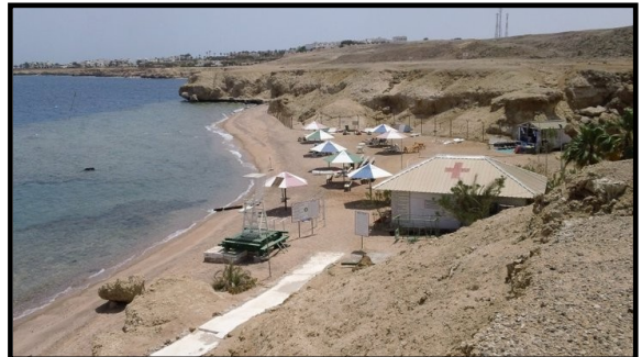
Interactive Map: http://www.mfo.org/sinaimap.php ; Top Right: Combat Water Survival Test; Middle Right: Gym area; Bottom Right: Herb's Beach