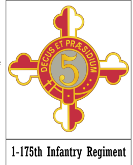
1-175th Infantry Regiment